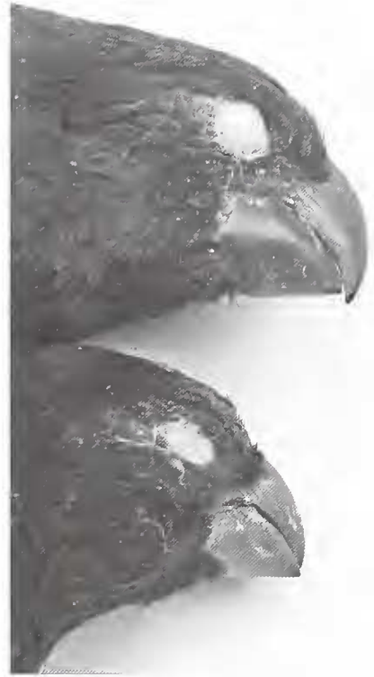
Figure 2. Comparison of bill size between Cuban Bullfinch Melopyrrha n. nigra of Cuba (lower bird) and M. n. taylori of Grand Cayman (upper bird), United States National Museum, Smithsonian Institution, Washington DC (James W. Wiley)

Female nigra is uniform dull slate-black and less glossy, sometimes almost dark slate, especially on the posterior underparts. The upperparts are almost uniform except the lower neck, back and rump are tinged brownish contrasting with the slate-black head. Female taylori is bicoloured, being mostly blackish slate on the head and upperparts, although not as dark as nigra , and has dull brownish olive-grey lower abdomen and flanks (Fig. 3). Throat, breast and upper abdomen are not dull black as in nigra , but are blackish grey contrasting with a paler lower abdomen and flanks. In Cuban females, the slate-black coloration is practically uniform from throat to undertail-coverts. Immature nigra resembles adult females, but have brownish wing feathers and tail, a smaller and less contrasting white wing patch, with no gloss or slate tones. Immature male taylori resemble adult females, with an olive-tinged dark head and much paler olive-grey posterior upperparts (Ridgway 1901), brownish fringes to the primaries, and abdomen tinged cinnamon. White in the wing is reduced or absent in both sexes (Bradley & Rey-Millet 2013).